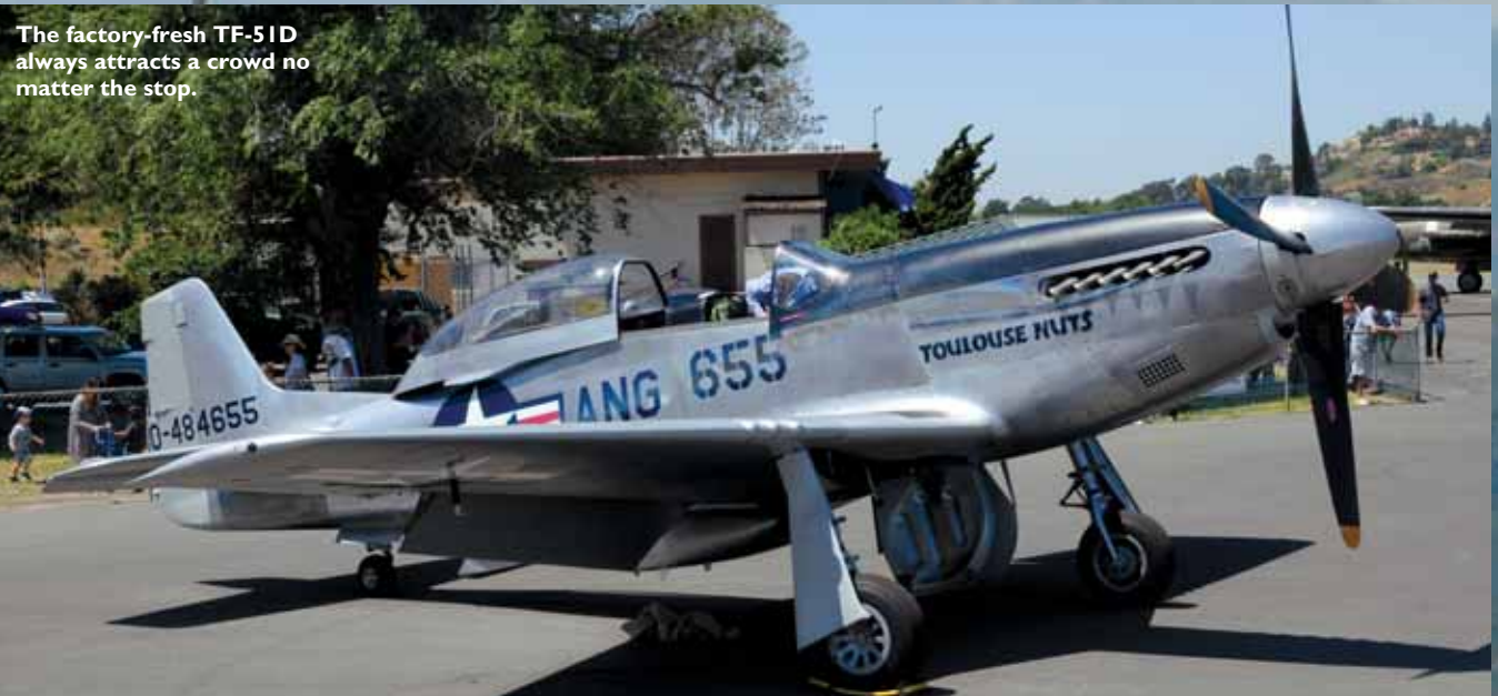
The factory-fresh TF-51D always attracts a crowd no matter the stop.

“The TF-51D is just such a great aircraft and, if a passenger is qualified we put him in the front seat and it is very exciting to get the chance of sharing the Mustang and its history with another pilot. Of course, many of our customers just want to go for a ride and feel all the noise and power of